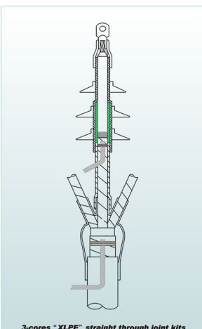
3-cores "XLPE" straight through joint kits